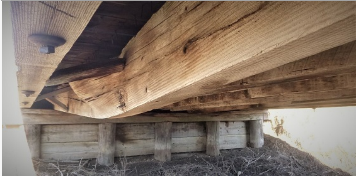
Bridge inspection in central Nebraska.