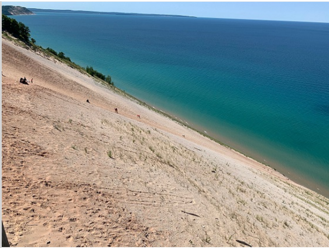
Vacationers sliding down the dunes in Sleeping Bear Dunes, Michigan.

To submit a picture for our newsletter, please send the image and a brief caption including the name of the photographer to rachel.caesar@hdrinc.com .