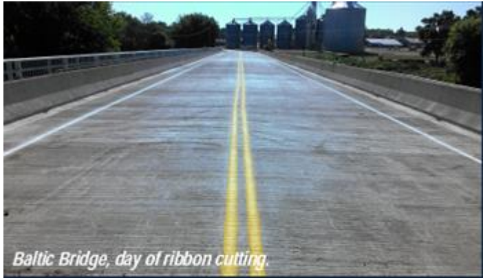
Baltic Bridge, day of ribbon cutting.

On September 11, 2012, structural deficiencies required the closure of Baltic Bridge, outside of Baltic, SD. Due in large part to the problem solving skills and team dedication, the design and construction process was completed in ten months, with the ribbon cutting for reopening the bridge on July 16, 2013.