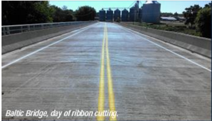
Baltic Bridge, day of ribbon cutting.

On September 11, 2012, structural deficiencies required the closure of Baltic Bridge, outside of Baltic, SD. Due in large part to the problem solving skills and team dedication, the design and construction process was completed in ten months, with the ribbon cutting for reopening the bridge on July 16, 2013.